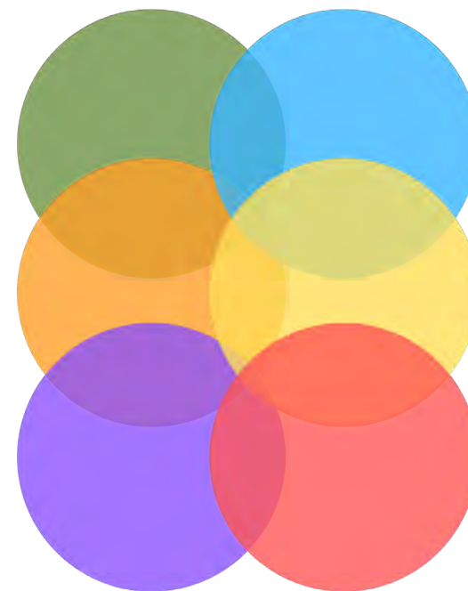
Cross-Case Comparative Analysis