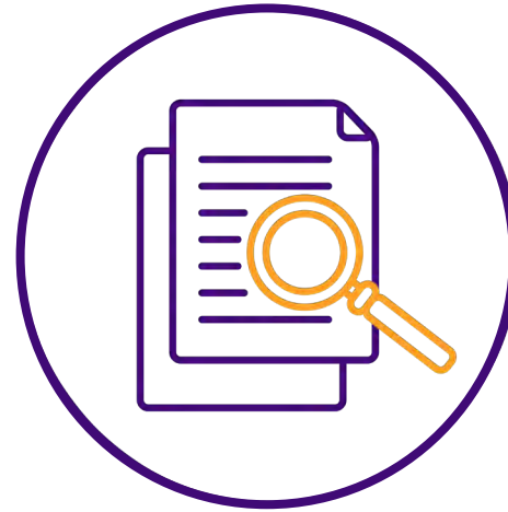
Policy, Document, & Context Scan