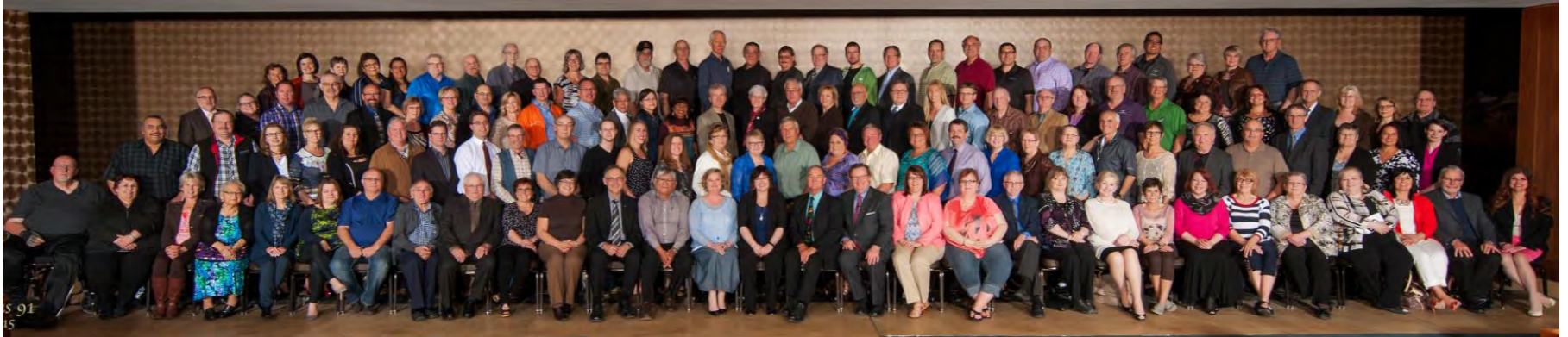
Saskatchewan trustees at the SSBA 100 th Anniversary Fall General Assembly in 2015