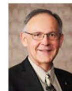
Jerome Niezgoda Catholic Constituency