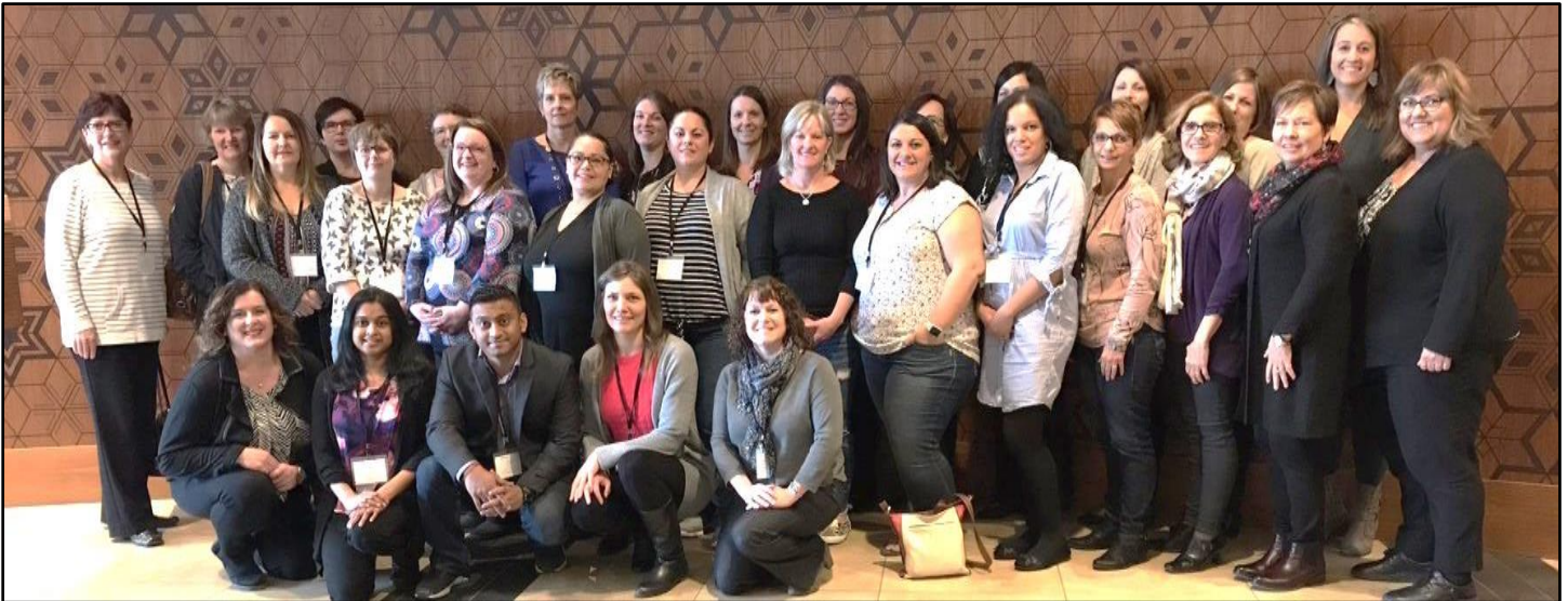
The 2018 Benefits and Pension Administration Seminar took place in Regina in October.