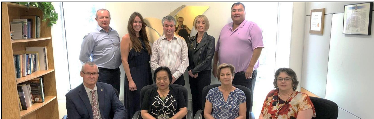
Visitors from the New Zealand School Trustees Association toured Saskatchewan in June, including visiting the SSBA offices in Regina.