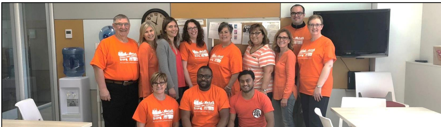
SSBA and SASBO staff members participated in Orange Shirt Day in September.

The Saskatchewan School Boards Association (SSBA) encouraged everyone to wear orange and to think about residential schools as "Orange Shirt Day" was officially proclaimed in the province.