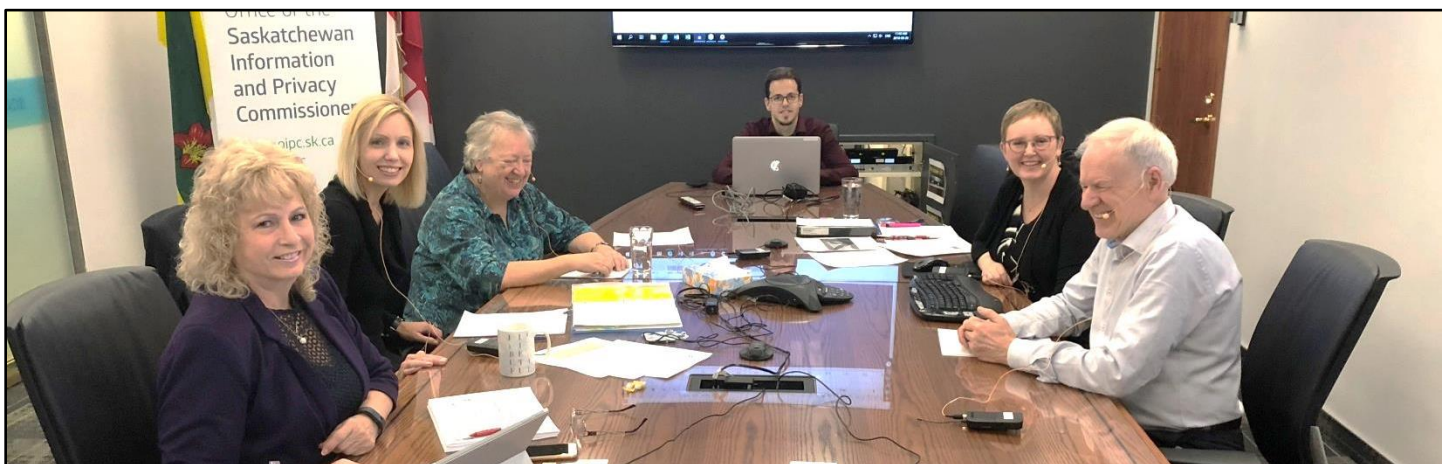
Members of the SSBA Legal Services team participated in a webinar with the Saskatchewan Information and Privacy Commissioner's office in September.