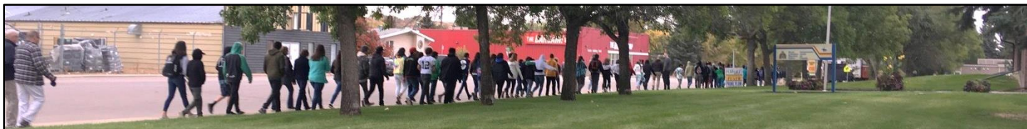
The 2018 Walk to Breakfast event took place at Bert Fox Community High School in Fort Qu'Appelle in September.

Efforts of Saskatchewan schools to improve student nutrition and create healthier environments were celebrated in September with the Mosaic Extreme School Makeover Challenge's Walk to Breakfast.