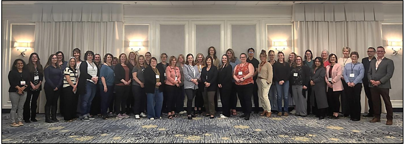
The 2026 SSBA Employee Benefits Plan (EBP) Seminar was held in Saskatoon in May and was attended by 39 people representing from 21 school divisions, and the agenda included two guest speakers, from Manulife and ComPsych.