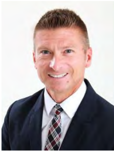
League of Educational Administrators, Directors and Superintendents