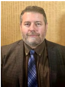
Saskatchewan Association of School Business Officials

The SSBA's Vision 2025 document states " The work of the SSBA and its member boards remains deeply rooted in the belief that every child in Saskatchewan, regardless of where they live or their personal circumstances, must have the resources and supports they need to achieve and succeed. Collectively, the women and men who serve on Saskatchewan's boards of education are committed to serving children, youth, families and communities. " LEADS members consider working with the Trustees in pursuit of that ideal to be a privilege, and are grateful for the invitation to be a part of this prestigious event.