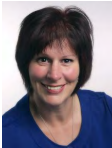
CUPE Sask. Education Workers Steering Committee

I wish you all the very best in the coming year and trust you will have a productive Fall General Assembly.