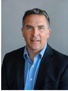
Saskatchewan Teachers' Federation