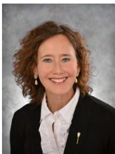
Government of Saskatchewan

The Hon. Bronwyn Eyre, Minister of Education