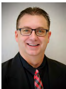
Canadian School Boards Association

I look forward to continuing this important partnership and building off of your many great accomplishments. Best wishes to all of you for another successful convention!