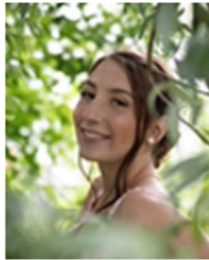
Degree Program Recipient