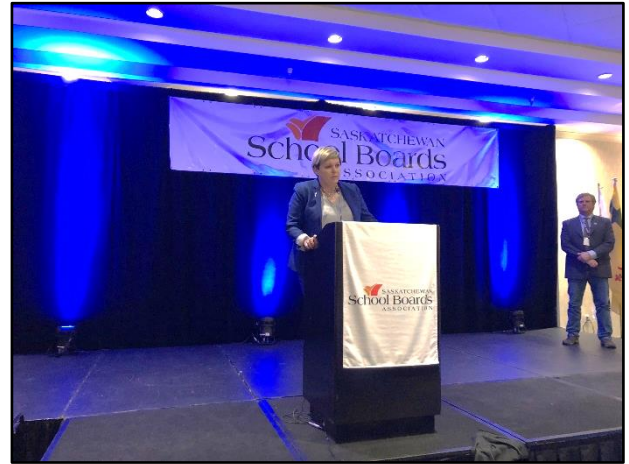
Greetings from the Government of Saskatchewan Hon. Tina Beaudry-Mellor