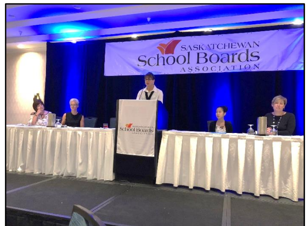
Inclusive Education Presentation Council for Exceptional Children