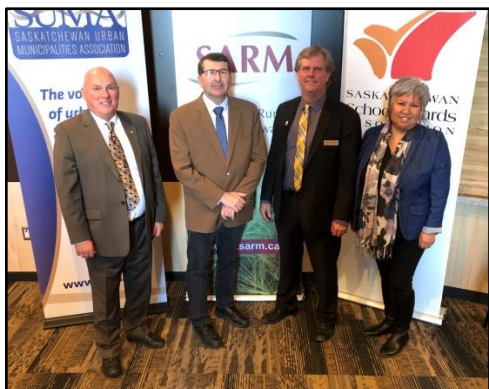
Representatives of the partner organizations participated in a kickoff media conference held in Saskatoon in November to launch Local Government Week 2018.

The first-ever Local Government Week was proclaimed in the province at the joint request of the Saskatchewan Association of Rural Municipalities (SARM), the Saskatchewan Urban Municipalities Association (SUMA) and the Saskatchewan School Boards Association (SSBA).