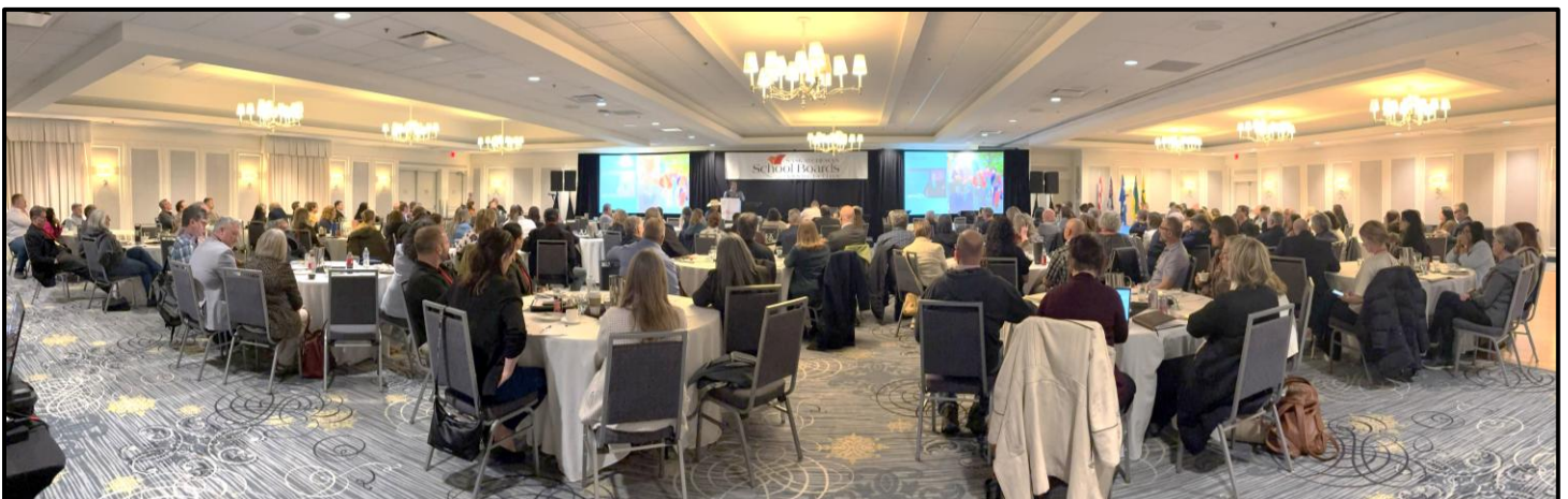
Spring Assembly – Trustees and other attendees participated in the event in Saskatoon in April