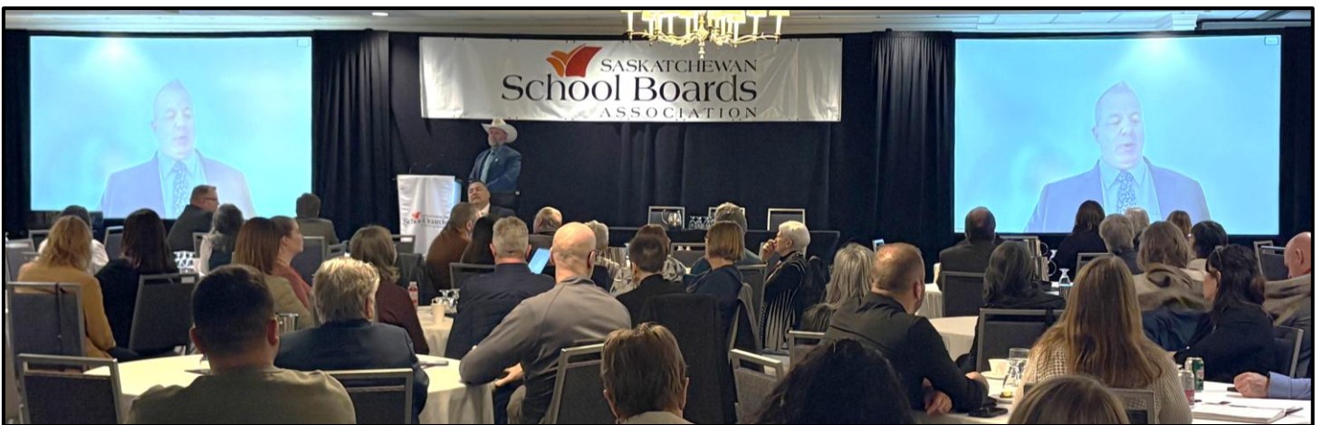
Greetings from the Government of Saskatchewan (virtual) – Legislative Secretary for Education, Dakota-Arm River MLA Barret Kropf