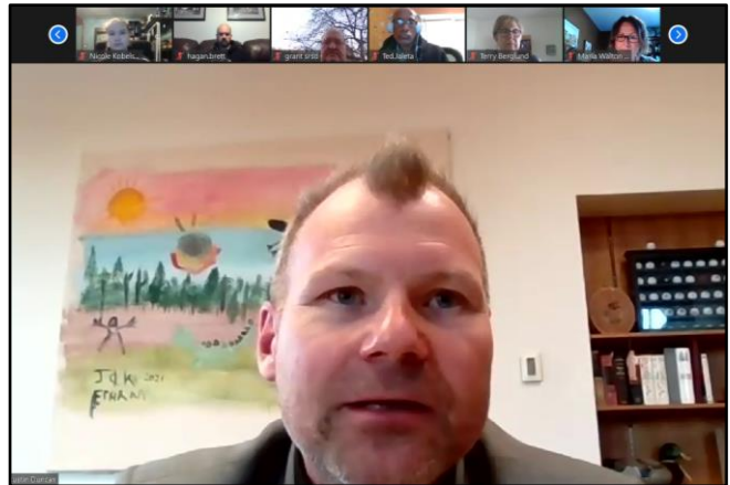
Greetings from the Minister of Education Hon. Dustin Duncan