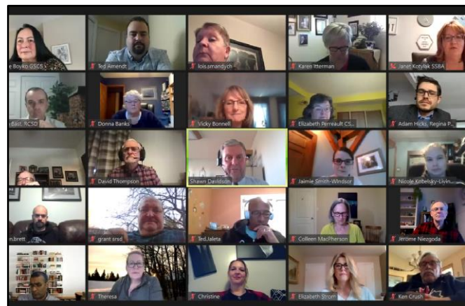
2021 Spring Assembly Virtual attendees on Zoom