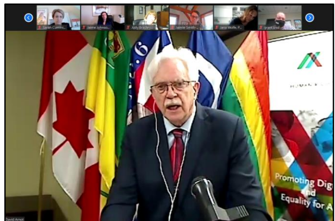
Citizenship Education in Saskatchewan Human Rights Chief Commissioner Judge David Arnot