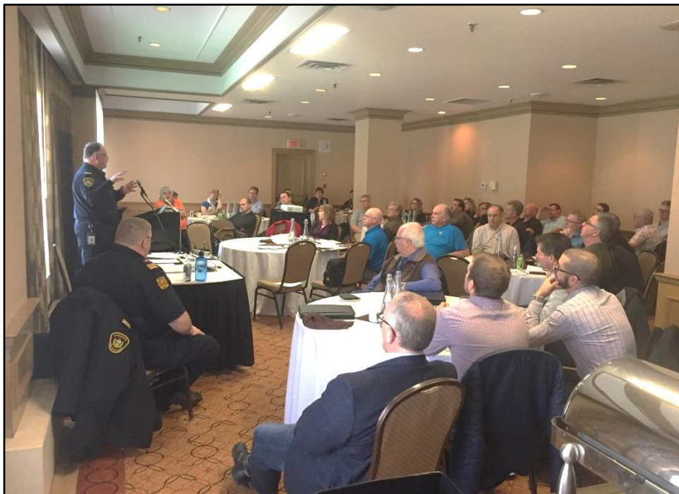
A presentation at the SSBA GIP Loss Control and Prevention Seminar 2018

Forty delegates from 18 school divisions and one delegate from the Ministry of Education attended the SSBA General Insurance Plan (GIP) Loss Control and Prevention Seminar that was held in Saskatoon in March. Attendees included primarily facilities personnel, along with a few CFOs and HR personnel.