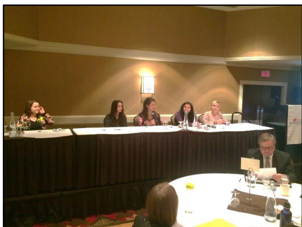
Representatives from Regina Public Schools participate as part of the Student Voice to the Board Panel