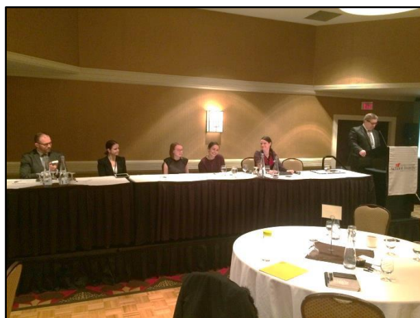
Representatives from Saskatchewan Rivers participate as part of the Student Voice to the Board Panel