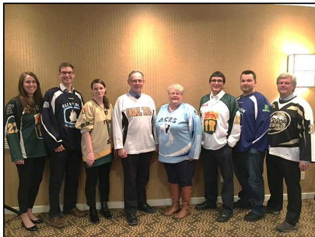
Members of the SSBA Provincial Executive wear jerseys at Spring Assembly in support of the Humboldt Broncos