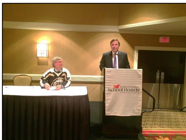
Deputy Premier and Minister of Education Gordon Wyant brings greetings to Spring Assembly delegates