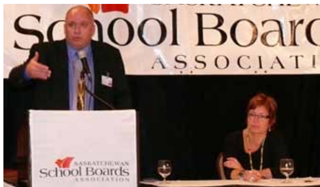
Deputy Minister of Education Dan Florizone and SSBA President Janet Foord co-present at the Fall General Assembly.

Helping guide the process is the synchronous ambitions of the Plan for Growth 2020 targets and the SSBA's Vision 2025. The Plan for Growth aims to lead the country in graduation rates by 2020 while the SSBA's Vision 2025 plans for all Saskatchewan students to achieve at the highest level globally.