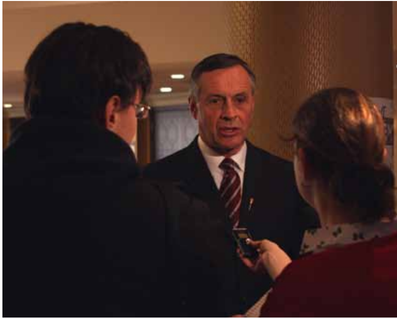
Minister of Education Don Morgan speaks to the media following his speech at the Fall General Assembly.

He also spoke to the unveiling of a new capital funding priority list in the 2014-2015 budget announcement that will include the need for building new facilities and repairing existing structures.