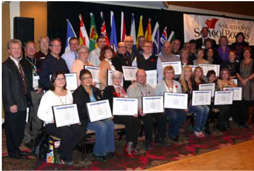
Each board of education was provided a framed copy of the federal government's 2008 Statement of Apology to former students of Indian Residential Schools.

SSBA seeks partnership with the Ministry of Education, Ministry of Health, Saskatchewan Teachers' Federation and other stakeholders to develop and implement a provincial health action plan for children to assist school divisions developing comprehensive health policies. (84.6% support)