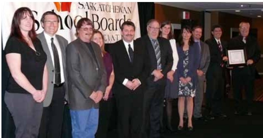
The Chinook Board of Education along with staff members receiving the Premier's Board of Education Award for Innovation and Excellence at the 2013 Fall General Assembly in Saskatoon.

trying to accommodate a broad variety of priorities and, as a result, really had no priorities," said