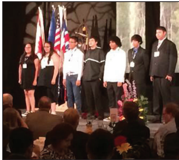
Youth Mentors honoured at the Aboriginal Youth Awards in Saskatoon at TCU Place.