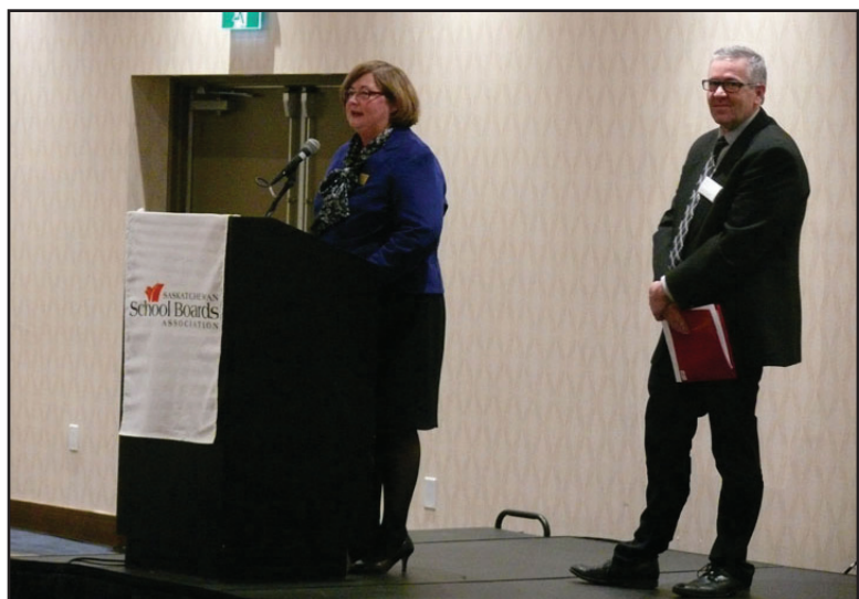
Acting Deputy Minister of Education Greg Miller and Incoming Deputy Minister of Education Julie MacRae discuss the future with attendees at the SSBA's Members' Council on Feb. 5. The two officials also took questions from attendees on a wide variety of topics related to the education sector, including funding, infrastructure and collaboration.