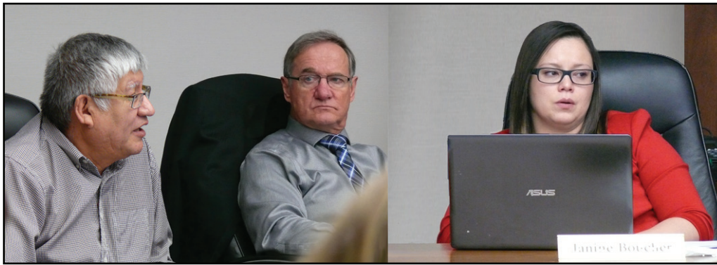
Executive members discuss a variety of issues at the Jan. 22-23 meeting in Regina.

The Provincial Executive of the SSBA met in Regina on Jan. 22 and Jan. 23.