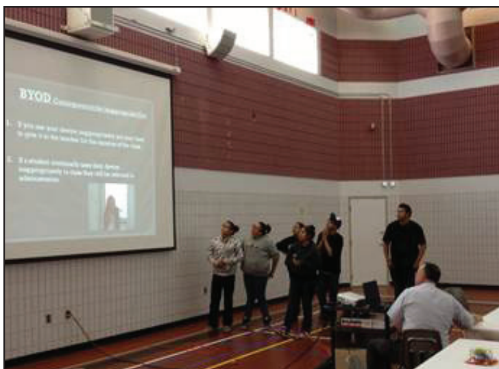
The Youth Mentors present to the parents of Kinistin students who will be transitioning to Tisdale Middle and Secondary School.

Click here to read the full submission on the SSBA website at www.saskschoolboards.ca .