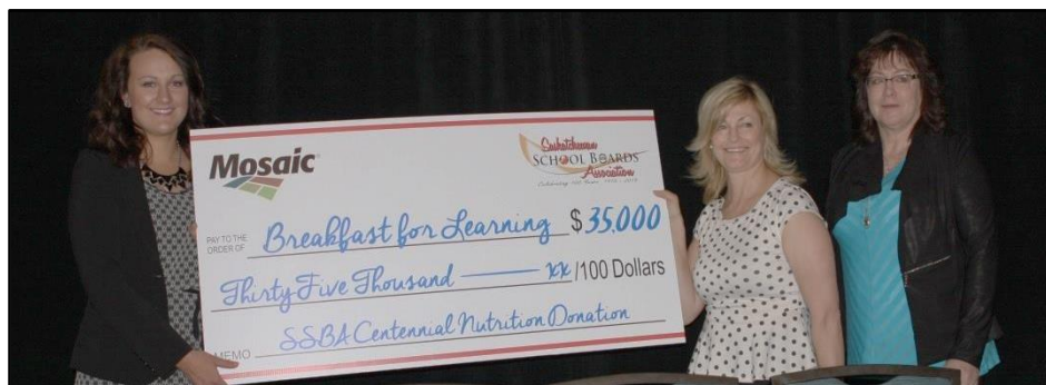
Centennial Nutrition Donation Cheque Presentation at Spring Assembly

"Mosaic is proud to continue to support Breakfast for Learning in Saskatchewan. As a company, we understand the importance of