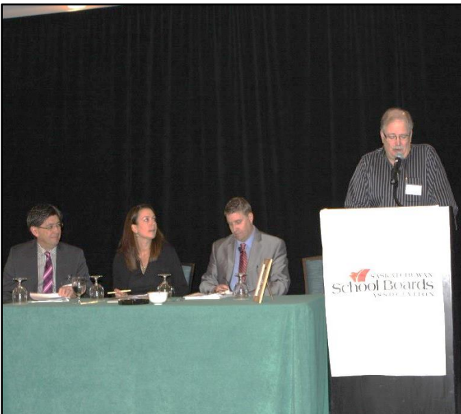
Representatives from the Chinook School Division present to Spring Assembly about their award-winning Reading Program during the Education Sector Strategic Plan Reading Hoshin session