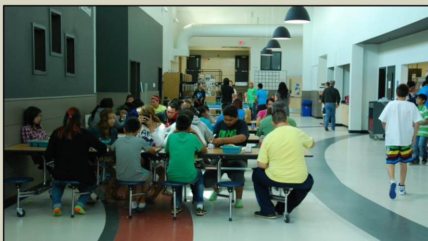
The busy common area of Stobart Community School

Stobart Community School's student population is 90 per cent First Nations and Métis.