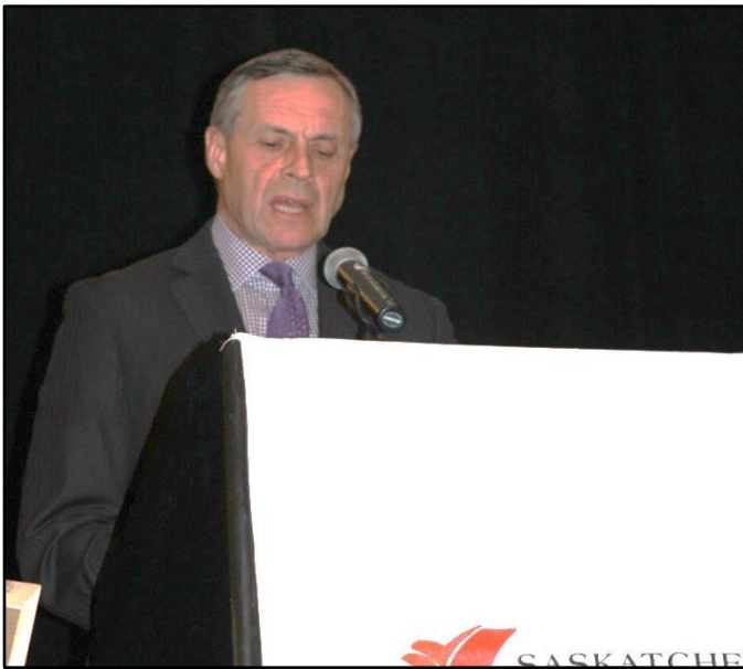
The Honourable Don Morgan, Minister of Education, brings greetings to the Spring General Assembly of the Saskatchewan School Boards Association on behalf of Premier Brad Wall and his government