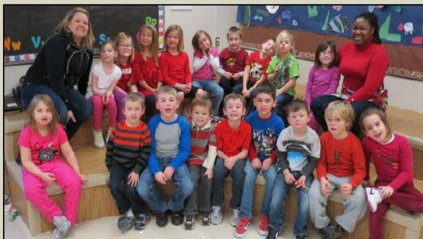
A "Graduating Class of 2027" from Light of Christ

Over the past seven years, Light of Christ Catholic Schools has been on a journey to establish a foundational learning environment to facilitate the graduation of all students. Structural and pedagogical changes have resulted in continual increases in student achievement.