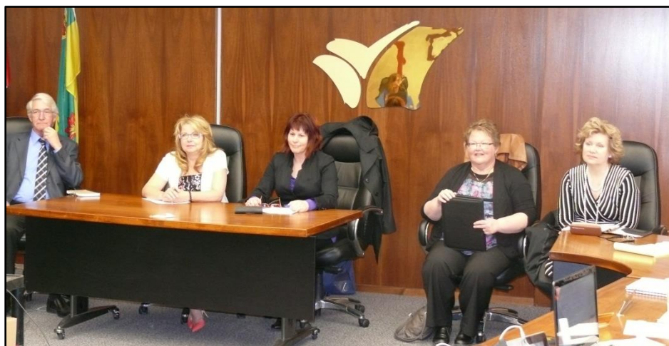
Representatives from the Canadian Union of Public Employees Sask.