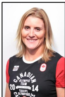
Haley Wickenheiser Haley is a four-time Olympic medalist and one of the best female hockey players in the world. Her passion for sport is matched by her desire to give back to her community.